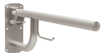
Single Arm Hinged Support Rail with Toilet Roll Holder