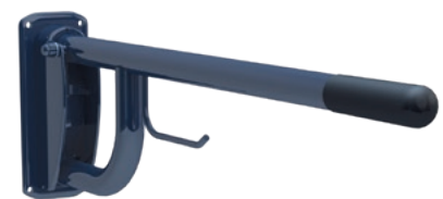
Single Arm Hinged Support Rail with Toilet Roll Holder