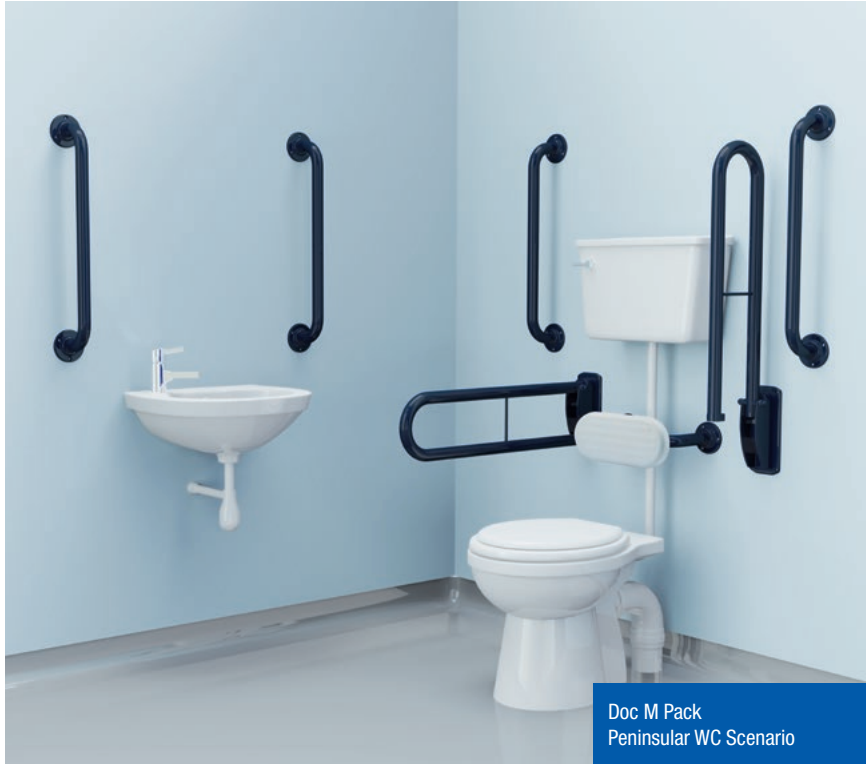
Doc M Pack Peninsular WC Scenario