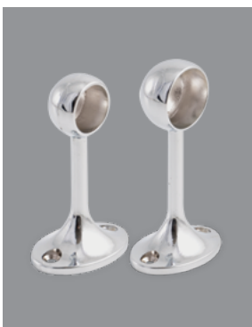
Ball End Brackets