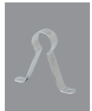
V Shape Bracket