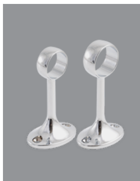
Ball Centre Brackets