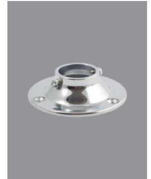
Brass Flange with Grub Screw