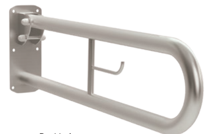
Double Arm Hinged Support Rail with Toilet Roll Holder